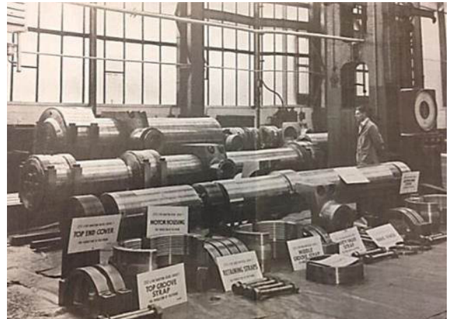
Almost 100 Years' Experience in Complex Vessels

Petrochemical | Oil & Gas | Plastics Industries | Foam Industries | Nuclear Reactors