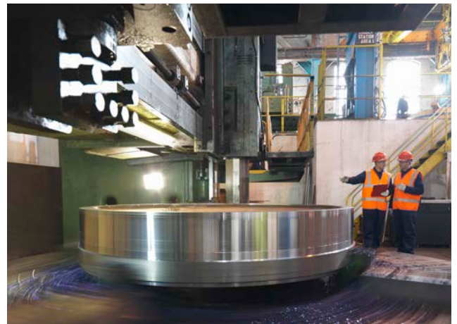
Large and Complex Component Abilities