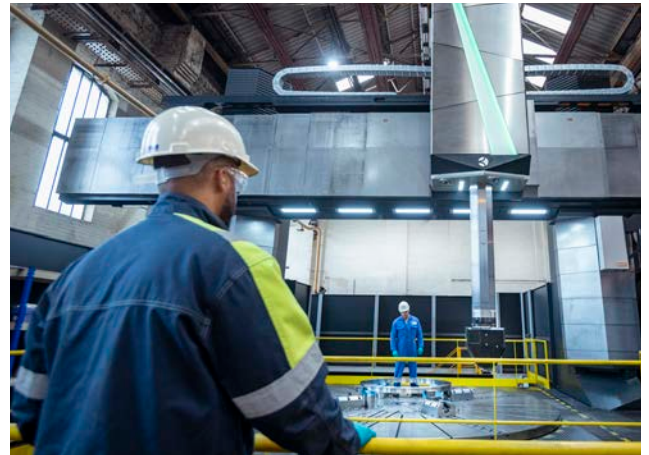
Most Advanced Machining Facilities in the UK